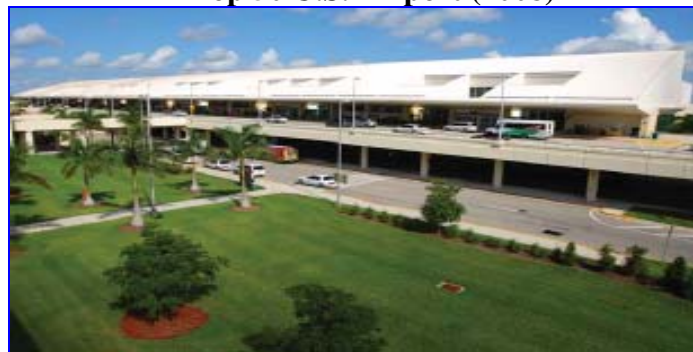
Southwest Florida International Airport